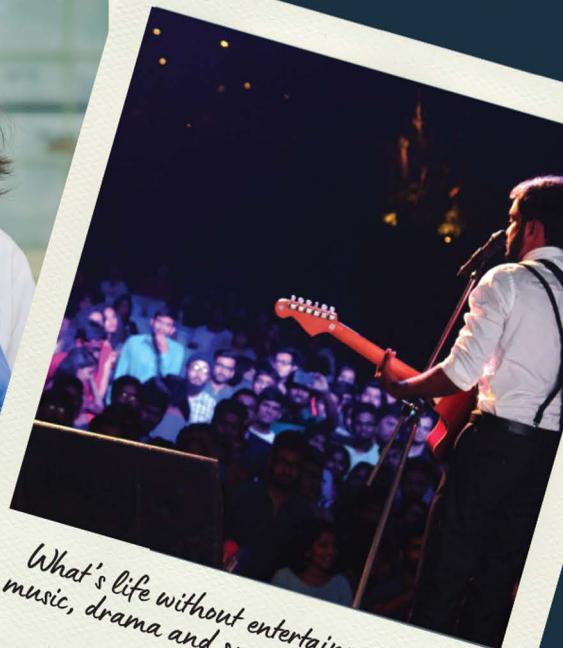
What's life without entertainment music, drama and so much more...