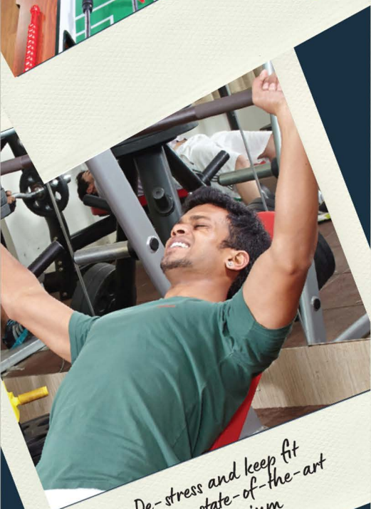
De-stress and keep fit with our state-of-the-art gymnasium