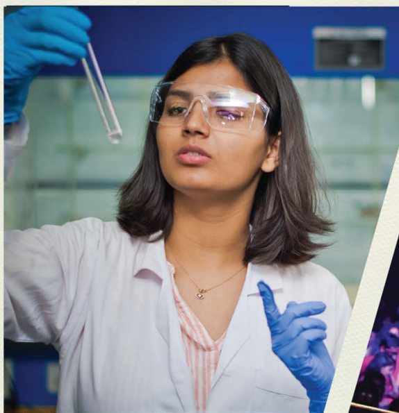
Academic life is always a buzz all over the campus at any given point