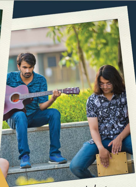
Get some work done whilst sipping on hot tea