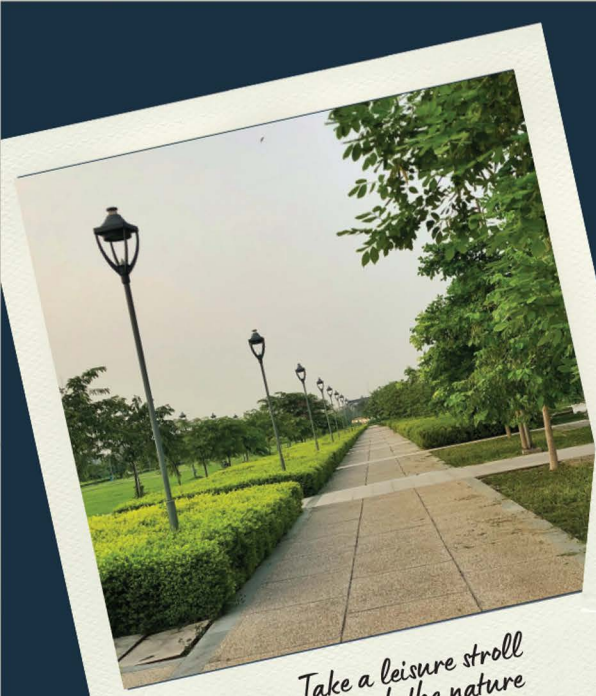
Take a leisure stroll through the nature clad campus