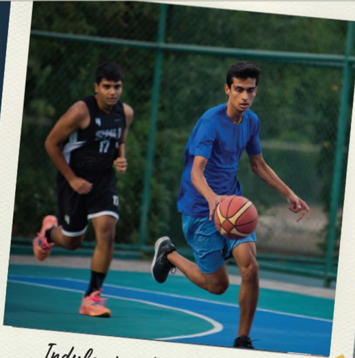
Indulge in adrenaline pumping sport activities