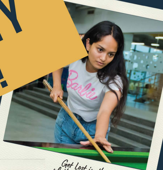
Get lost in the plethora of books in our Central Library