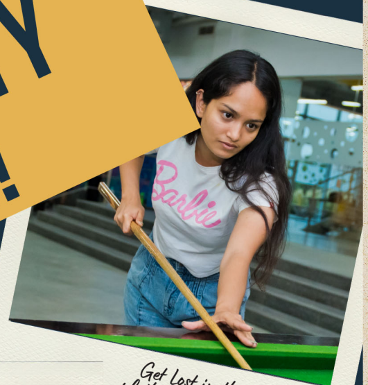
Get lost in the plethora of books in our Central Library