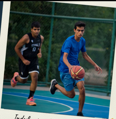
Indulge in adrenaline pumping sport activities