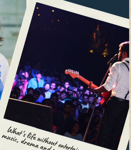
What's life without entertainment music, drama and so much more...