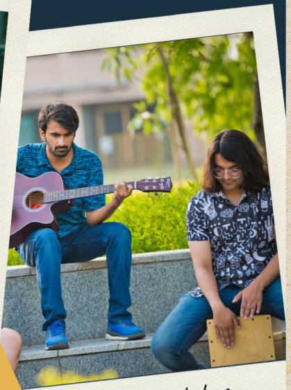
Get some work done whilst sipping on hot tea