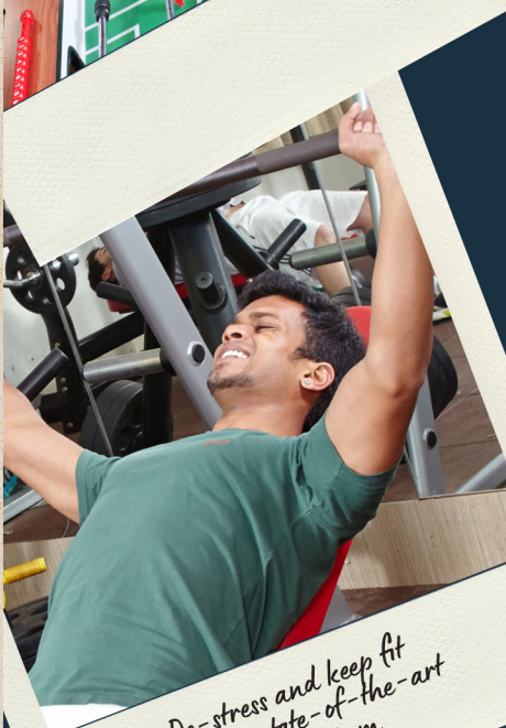
De-stress and keep fit with our state-of-the-art gymnasium