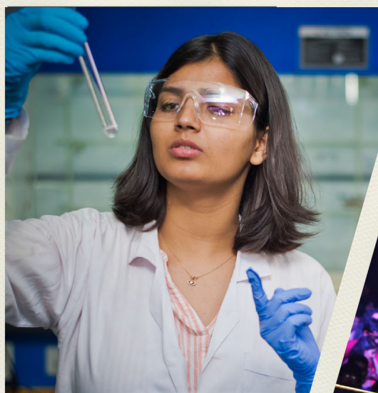
Academic life is always a buzz all over the campus at any given point