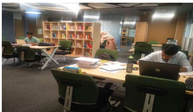
Graduate students at the Department library