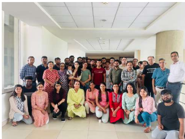
Faculty, staff, and Ph.D. students (2022).