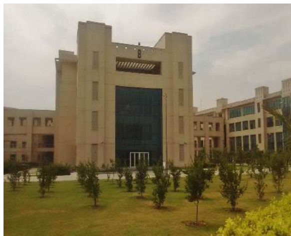
The Department of Mathematics is housed in the School of Natural Sciences.