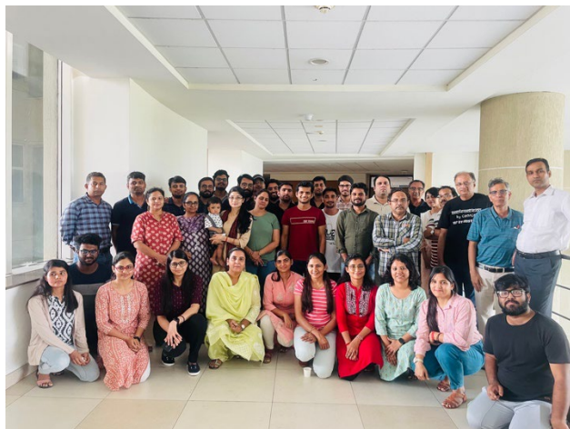
Faculty, staff, and Ph.D. students (2022).