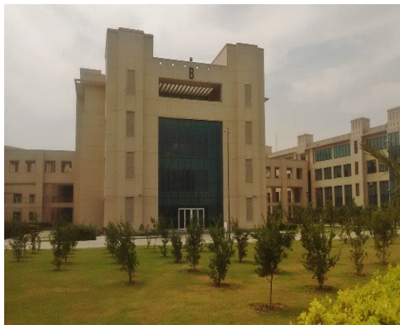
The Department of Mathematics is housed in the School of Natural Sciences.