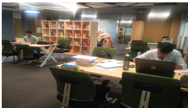
Graduate students at the Department library