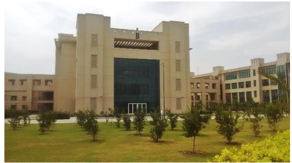
The Department of Mathematics is housed in the School of Natural Sciences.