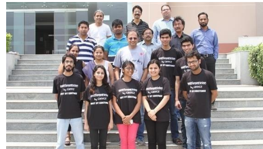
Faculty members with the founding batch of BSc (Research) Mathematics 2011.