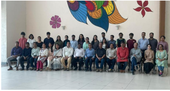
Department photograph with graduating batch of 2023.