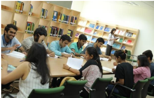
Undergraduate students in the Department Library, set up under a DST-FIST grant.