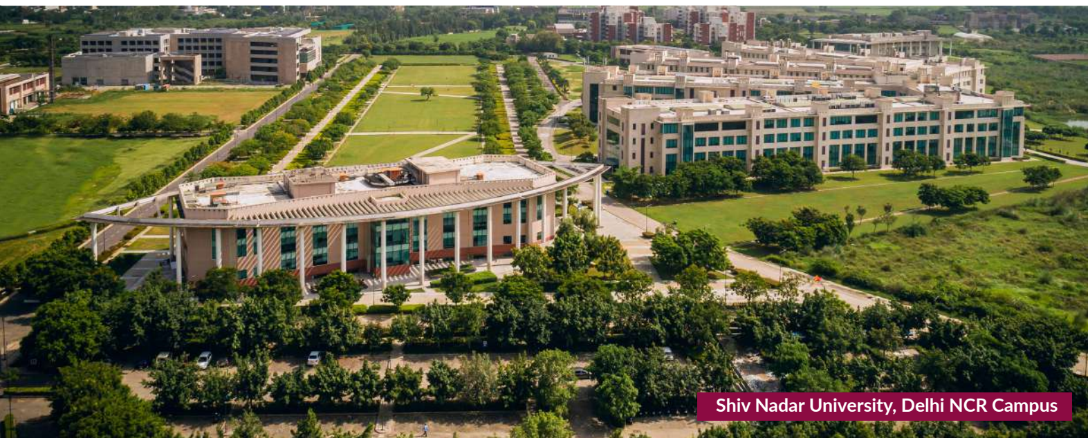
Shiv Nadar University, Delhi NCR Campus