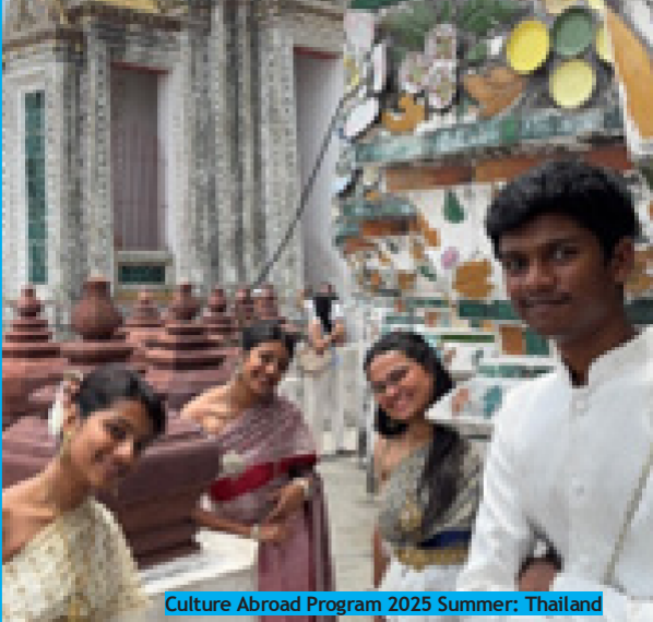
Culture Abroad Program 2025 Summer: Thailand