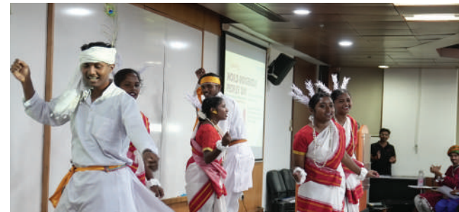
Students from the Tea Gardens of Jalpaiguri district of West Bengal performing a Sadri (Chota Nagpuri) dance at the World Indigenous Peoples' Day celebration.