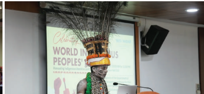
A student from the Particularly Vulnerable Tribal Group - Kolam tribe, performing a rap song in Marathi about the environmental costs of development borne by the tribal people.